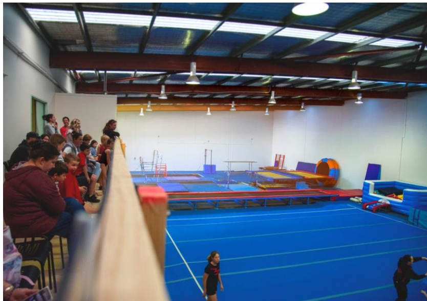
Viewing classes from the mezzanine!

Upstairs is our mezzanine viewing area, and from here you can see the whole gym! It is a great space for taking photos and videos of your kids too.